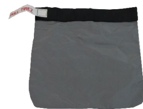
Simulated Activation Cord