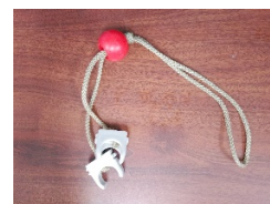
Red ball pull cord 6485-003