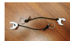
Clip Cord Assembly 6485-007